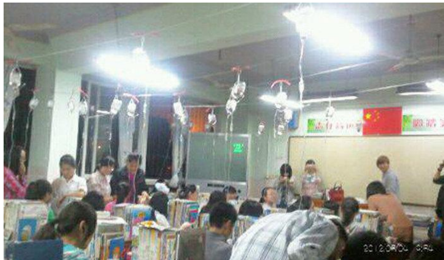
Fig. 1. High school seniors taking bottles of amino acids in classroom

In 2012, the exam took place on June 7th and 8th. An interesting nationwide phenomenon related to Gaokao triggered a series of learning activities in GuoKr communities. It started with a striking photo posted on Sina Weibo on May 6, 2012, which was rapidly and widely spread in hours. It was later confirmed that as shown in the photo, in Xiaogan, Hubei Province, a senior class were taking intravenous injections of bottles of amino acids by the side of their study desks at school (see Fig. 1).