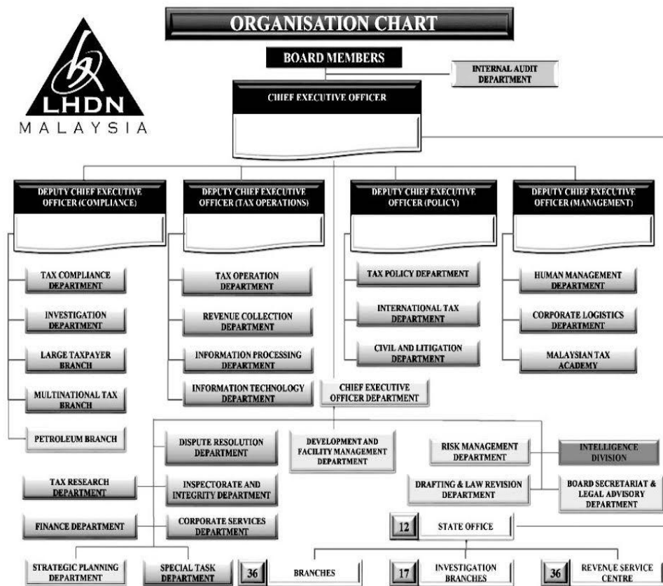
Fig. 1. IRBM organizational structure

It currently has 12 state offices and 36 branches in various locations all over the country. The vision of IRBM is to be a leading tax administrator that contributes to nation building. Its mission is to provide excellent tax services by improving voluntary compliance, implementing an integrated and transparent taxation system, increasing operational effectiveness through innovative processes and information technology, and by enhancing a competent workforce. Its quality policy is “with a foundation based on integrity, we are committed to provide the best service to the customers” (IRBM, 2016).