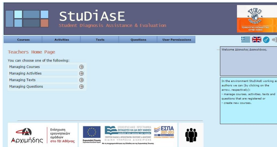
Fig. 6. Educator's home page

Similarly with the learner user interface, the educator user interface is also split into the theory and the laboratory sections. Once a section is selected, the user will be asked to log in. If the username/password corresponds to an account with educator access, the user is directed to the educator's user interface home page (Fig. 6). The home page of the educator allows the user to access the management pages of courses, activities, texts and questions. It is up to the administrator to limit the capabilities of an educator's account if that is deemed necessary, otherwise the educator can insert a virtually infinite amount of educative material into the system. It is also possible to give certain educator privileges to accounts, such as the ability to manage activities and questions but not courses, allowing the creation of educator accounts that can essentially only work within their own course.