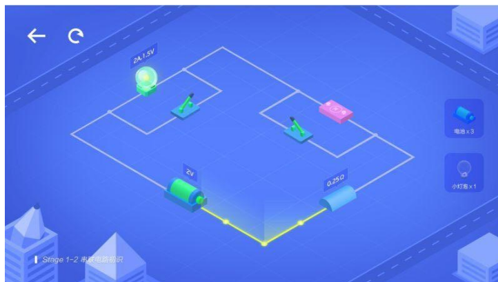
Fig. 1. A screenshot of the game

To rate the quality of the demonstrated game, the participants were presented with a prototype game and scripted scenario designs, which resembled those in other studies (e.g., Lowry et al., 2013). The game was designed aligned with the curriculum for electricity and circuits in secondary physics in Mainland China. The major expected learning outcomes of the game include understanding related concepts such as series circuits, resistance, electrical appliances, identifying the problems of given circuit connection, applying the circuit laws to create workable circuits. Fig. 1 presented a screenshot of the game.