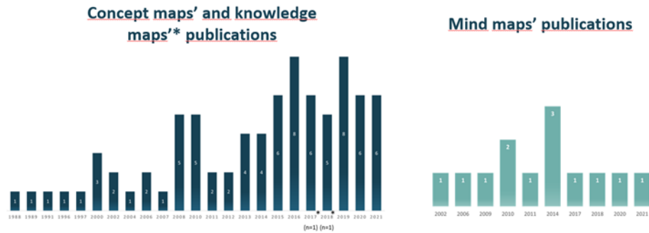
Fig. 2. Yearly numbers of the articles included in the scoping review