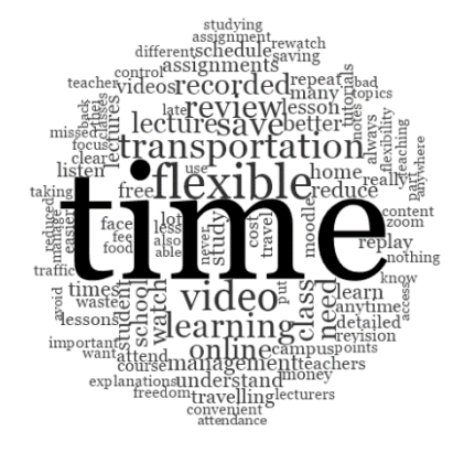
Fig. 2. Word cloud generated for "Student – Benefits"