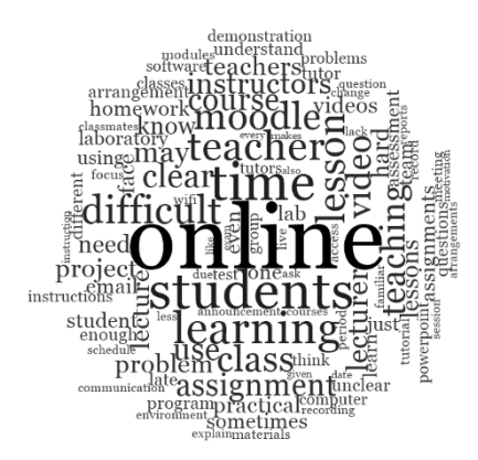
Fig. 1. Word cloud generated for "Student – Problems"

The most frequently appearing words for teachers support included: online (f = 14), teaching (f = 12), student(s) (f = 11), support/supported/supporting (f = 10), and time(s)/timely (f = 7). The most frequently appearing words for teachers benefits included: student(s) (f = 16), online (f = 13), teaching (f = 13), learning (f = 12), use(d) (f = 8), face (f = 6), time (f = 6), and flexibility (f = 5). The keywords frequency is presented graphically as a word cloud in Fig 1-4.