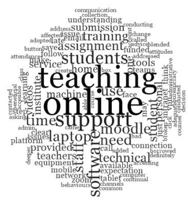
Fig. 3. Word cloud generated for